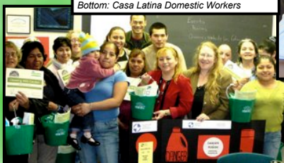
Bottom: Casa Latina Domestic Workers