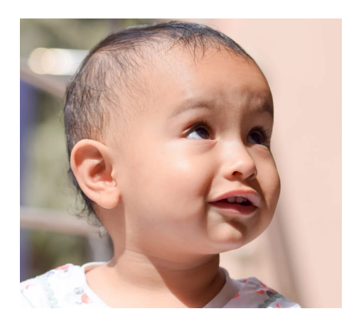
For more information visit: deohs.washington.edu/healthy_schools