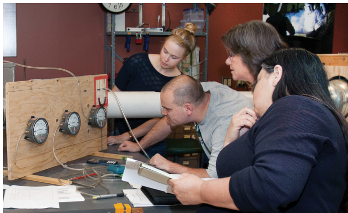
Students work on a training exercise.

Education, training and public awareness programs reach safety leaders and workers in construction, hazardous waste, occupational health and safety, disaster preparedness, environmental health and more.