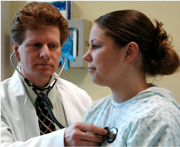
Our clinicians diagnose, treat and prevent diseases caused by workplace exposures.