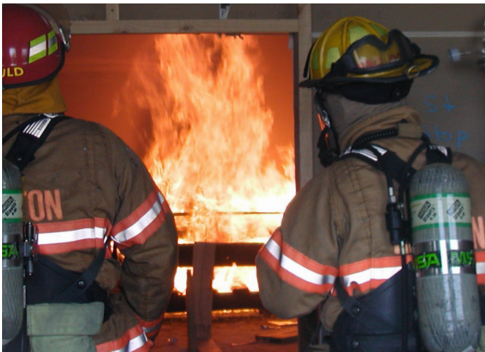
Our lab analyzes compressed air samples for Washington state fire departments.