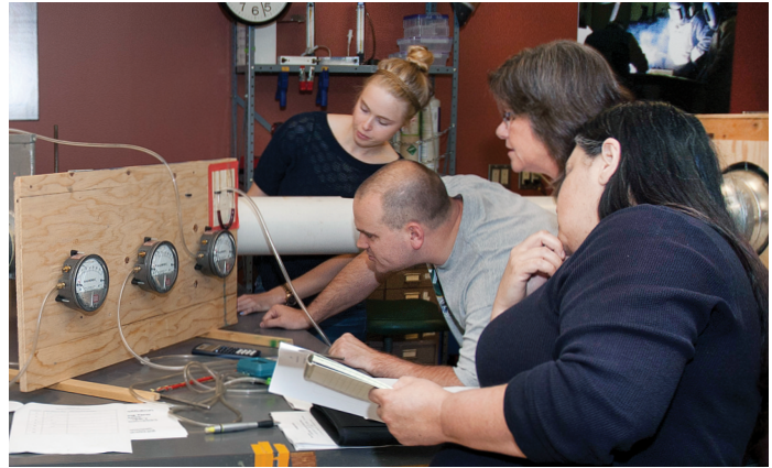
Students work on a training exercise.

Education, training and public awareness programs reach safety leaders and workers in construction, hazardous waste, occupational health and safety, disaster preparedness, environmental health and more.