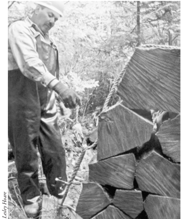
Cedar block cutter on Olympic Peninsula, Washington.

According to a written statement by the Washington State Department of Labor & Industries (L&I), health-related illness