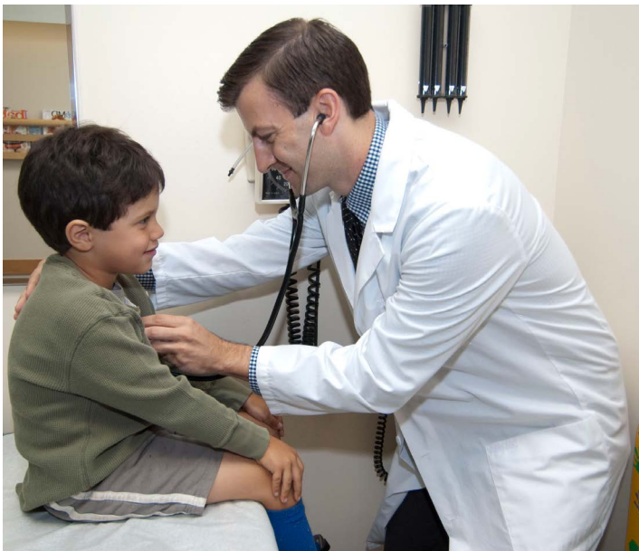
Our clinicians diagnose, treat and prevent diseases caused by workplace exposures.