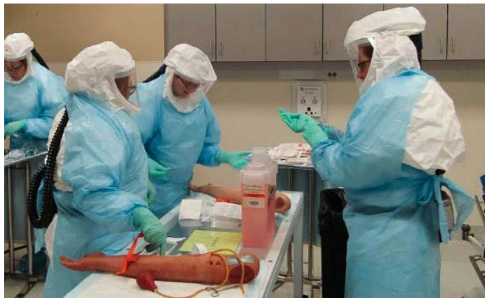
Students work on a training exercise.

Education, training and public awareness programs reach safety leaders and workers in construction, hazardous waste, occupational health and safety, disaster preparedness, environmental health and more.