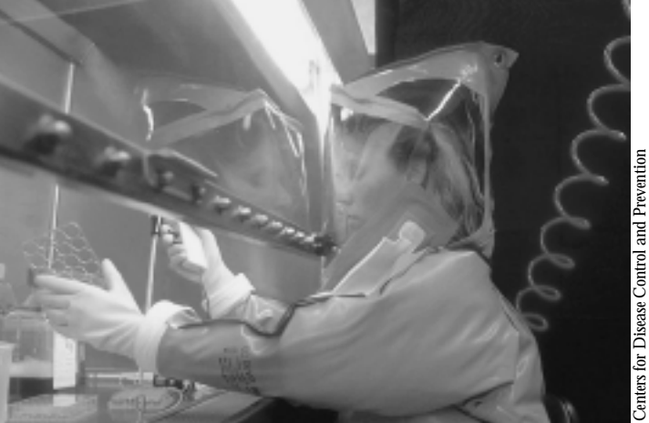
A CDC laboratory worker wears a protective suit and face mask to handle hazardous materials

University of Washington School of Public Health and Community Medicine Bioterrorism Concerns FAQ, http://depts.washington.edu/sphcm/news/bioterrorism.html