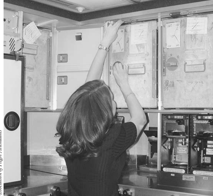
Association of Flight Attendants