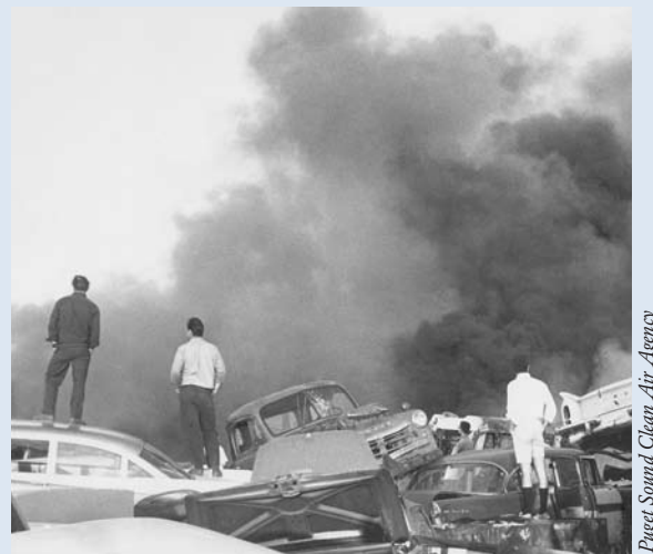
Puget Sound Clean Air Agency